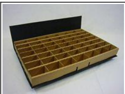
PT1 1/3 depth tray - 32mm deep Holds; Holds 49 GW, Coat D'arms or Foundry paint pots

Full Width Trays (Custom) 32 mm deep tray compartments