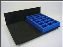
PT2 1/3 depth tray - 32mm deep Holds; Holds 18 GW, Coat D'arms or Foundry paint pots

Half Width Trays (Custom) 32 mm deep tray compartments